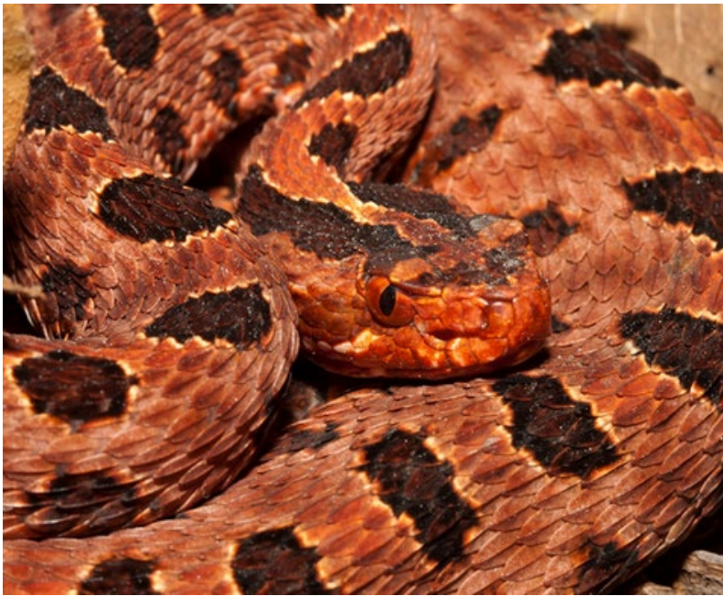
Carolina Pygmy Rattlesnake ( Sistrurus miliarius miliarius)